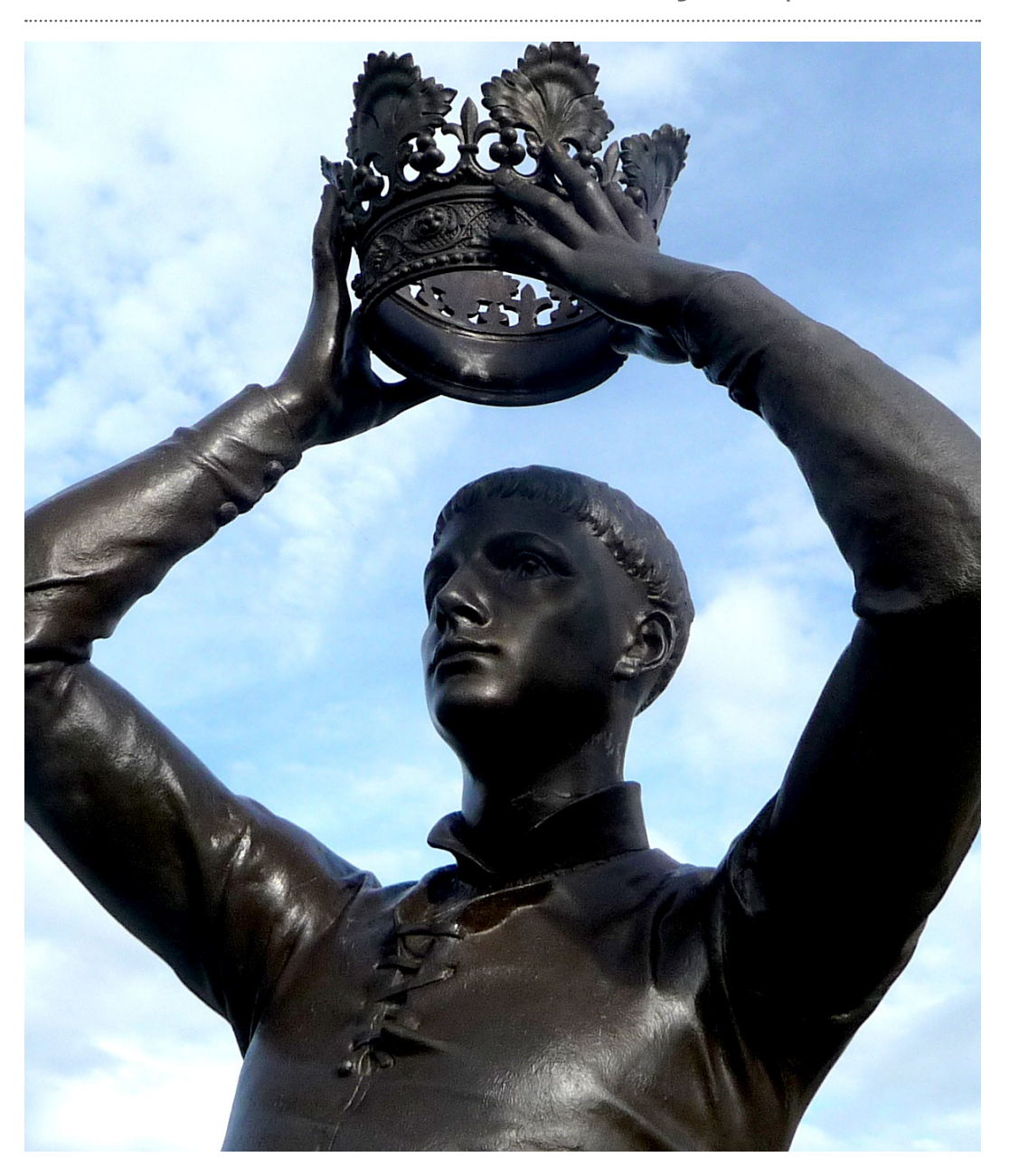
Gower Memorial, Prince Hal, Stratford, c.1876

NINETEENTH SUNDAY AFTER PENTECOST SEPTEMBER 29, 2024 • 11:00 AM