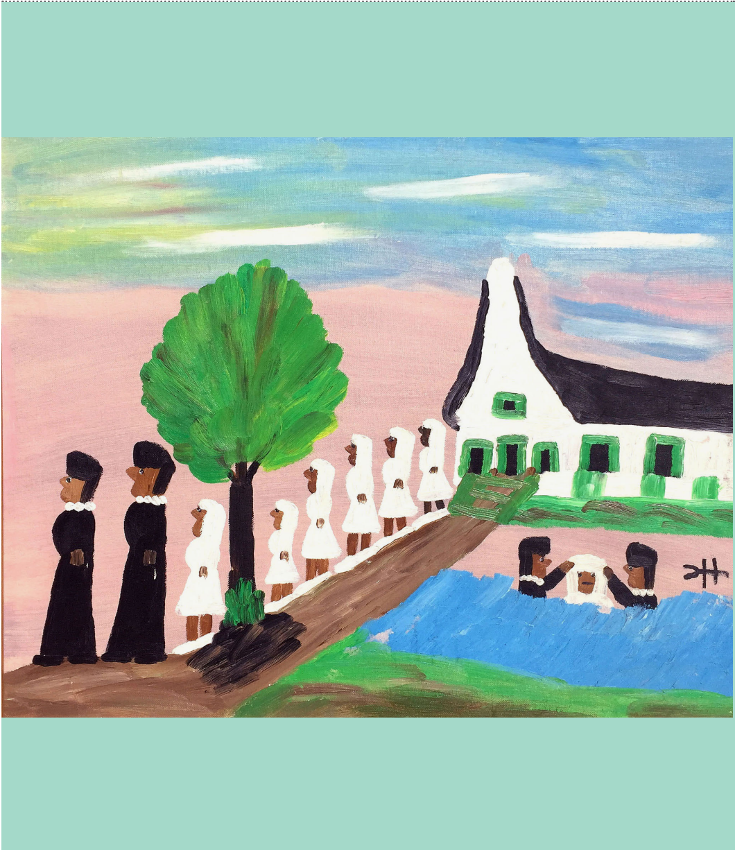
Clementine Hunter, Baptism, ca. 1970

BAPTISM OF THE LORD JANUARY 7, 2018 • 11:00 AM