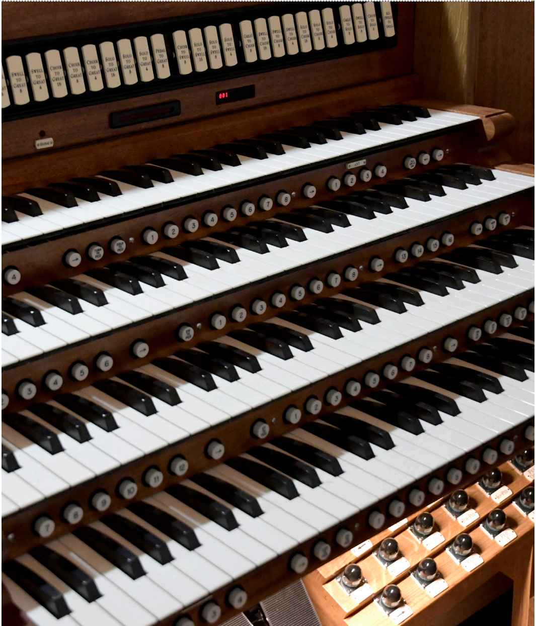
Porter Binks, New Organ Console , 2017

SINGING OUR FAITH JANUARY 21, 2018 • 11:00 AM