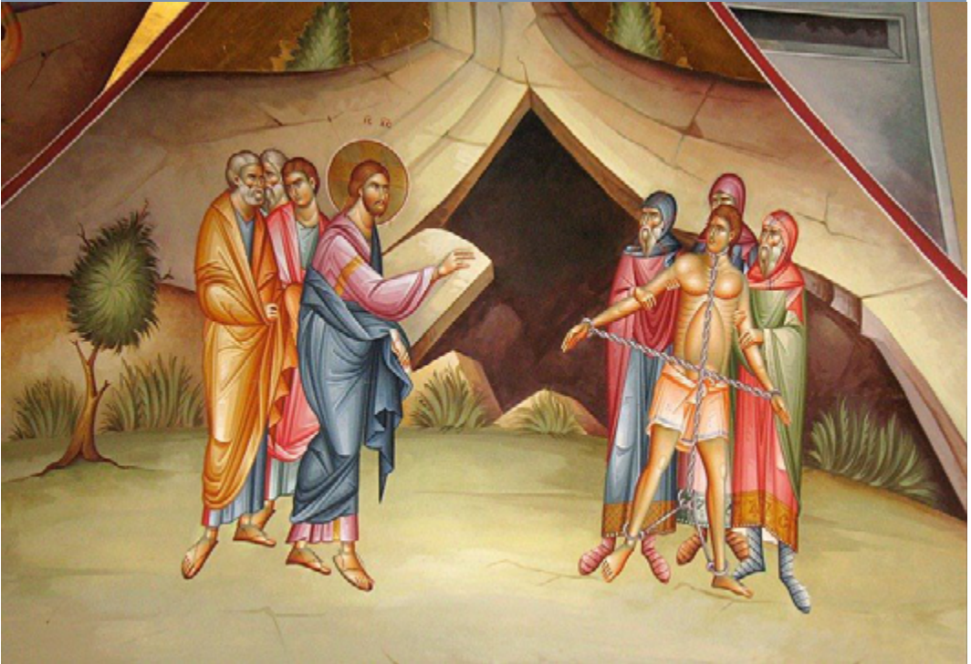
Healing of the Gerasene Demoniac

THIRD SUNDAY IN LENT MARCH 4, 2018 • 11:00 AM