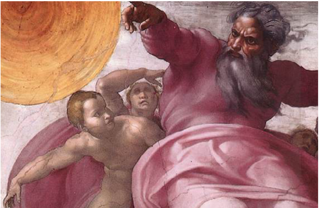
Michelangelo, The Creation of the Sun and the Moon , The Sistine Chapel, c. 1510