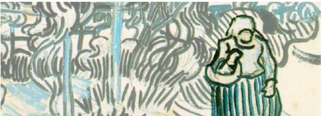
Vincent van Gogh, Old Vineyard with Peasant Woman , 1890