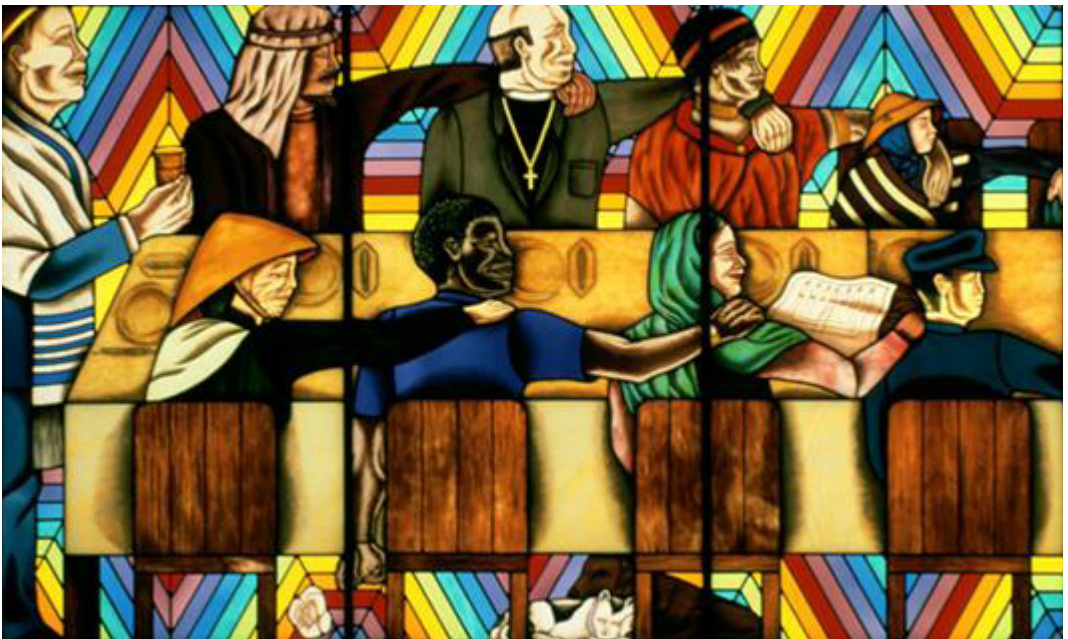
Judy Chicago, Rainbow Shabbat , 1992