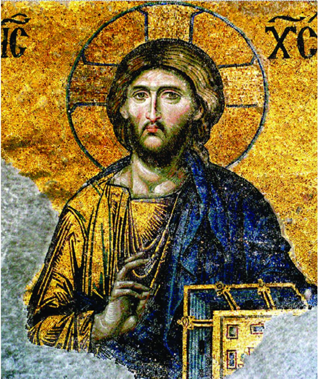
Christ Pantocrator (detail of the Deesis mosaic, Hagia Sophia, Istanbul), 12th century