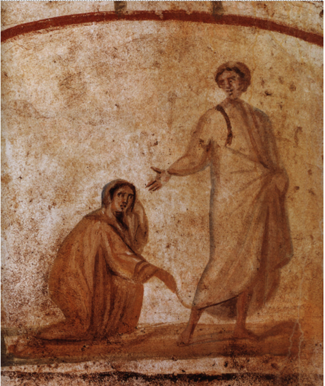
The healing of a bleeding woman, Catacombs of Marcellinus and Peter, Rome