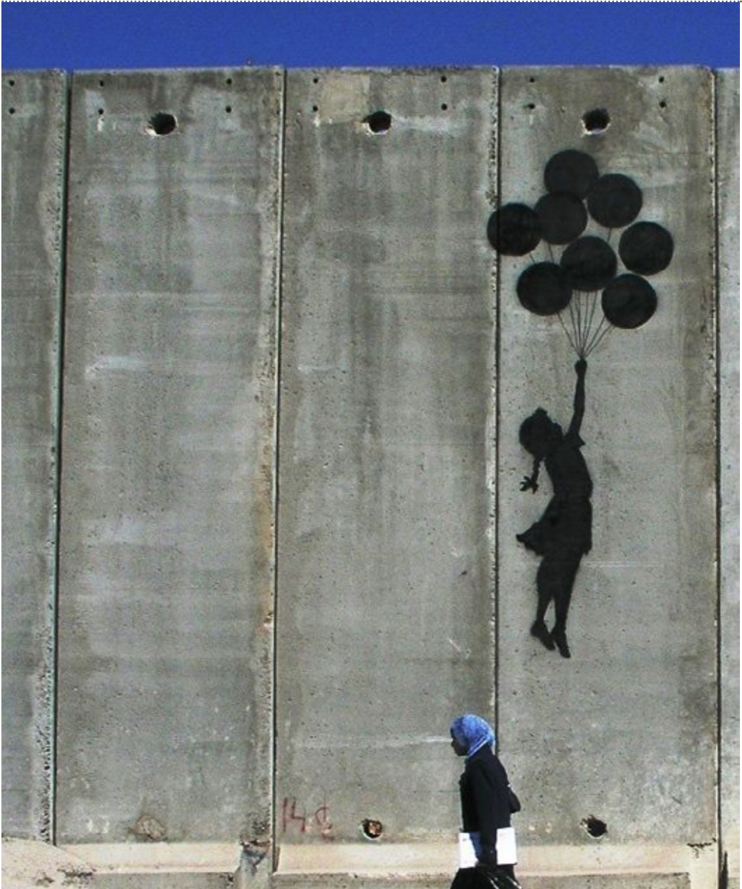
Banksy, Girl with Balloons , 2005–2007