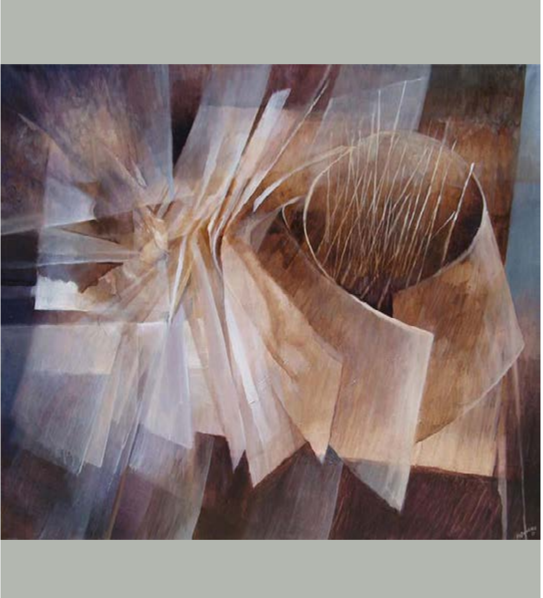
Rochelle Blumenfeld, Gathering II , 2010