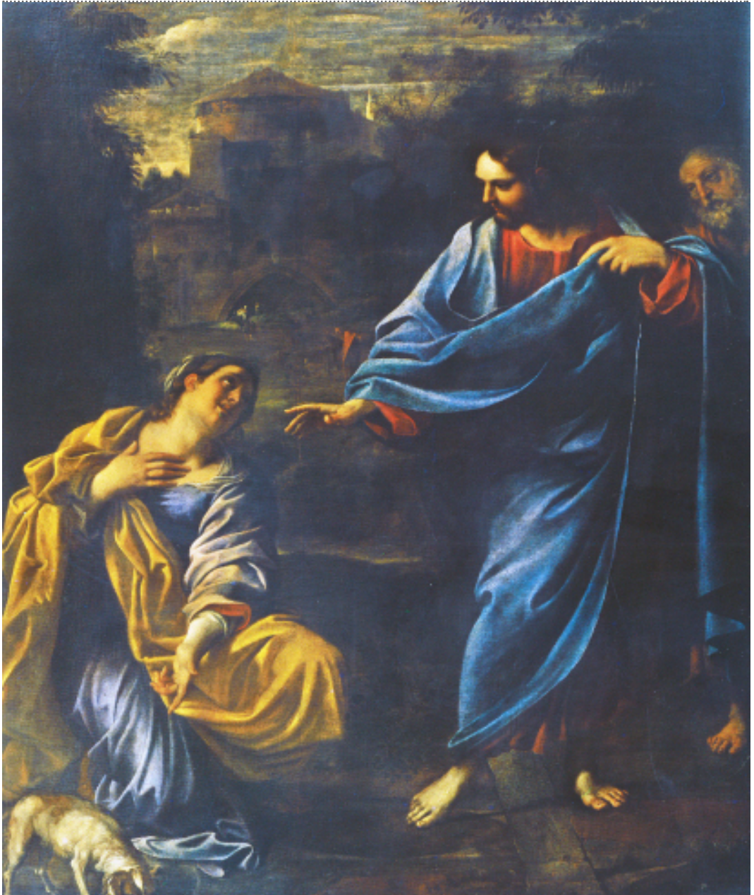
Annibale Carracci, Christ and the Canaanite Woman , 1595