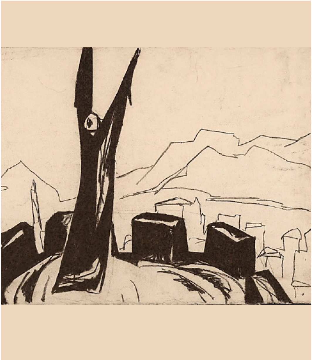
Peter Gorban, Prayer of Habakkuk , 1990

THIRD SUNDAY AFTER PENTECOST JUNE 9, 2024 • 10:00 AM