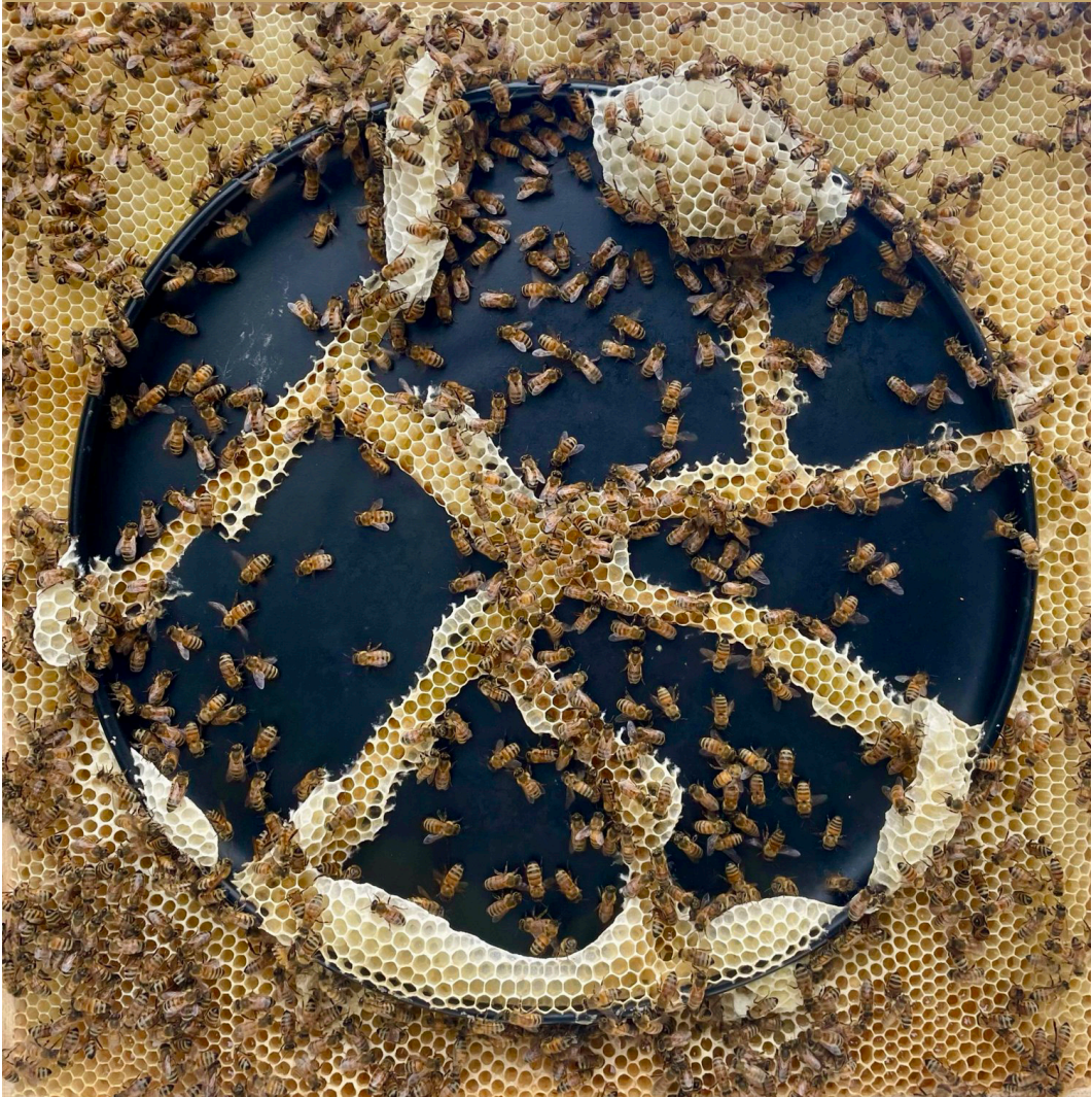
Kintsugi Platter, Ava Roth

TWENTY-FIRST SUNDAY AFTER PENTECOST OCTOBER 13, 2024 • 11:00 AM