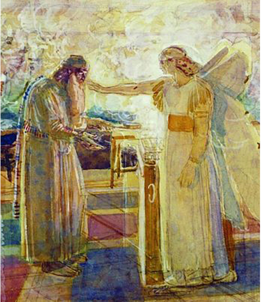
Alexander Andreyevich Ivanov, Gabriel Silencing Zechariah , c. 1850

SECOND SUNDAY OF ADVENT DECEMBER 8, 2024 • 11:00 AM