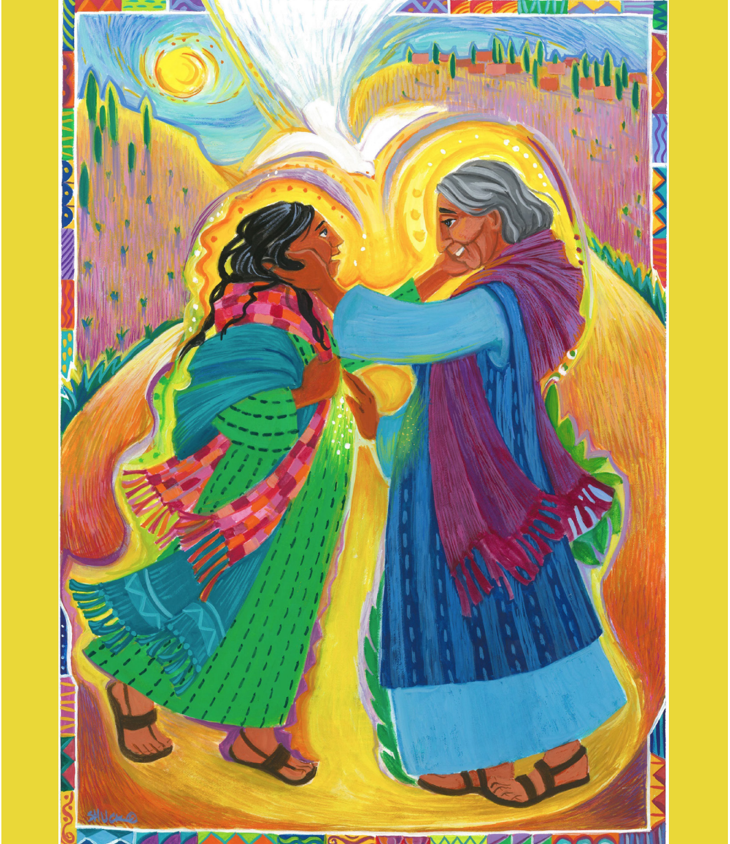
Mary and Elizabeth, 2021

FOURTH SUNDAY OF ADVENT DECEMBER 22, 2024 • 11:00 AM