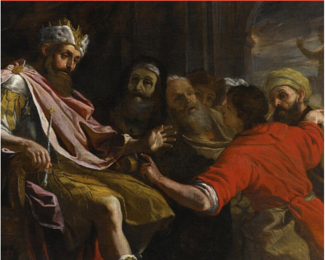
Mattia Preti, Daniel Interpreting Nebuchadnezzar's First Dream , c. 1670

FOURTH SUNDAY AFTER EPIPHANY FEBRUARY 2, 2025 • 11:00 AM