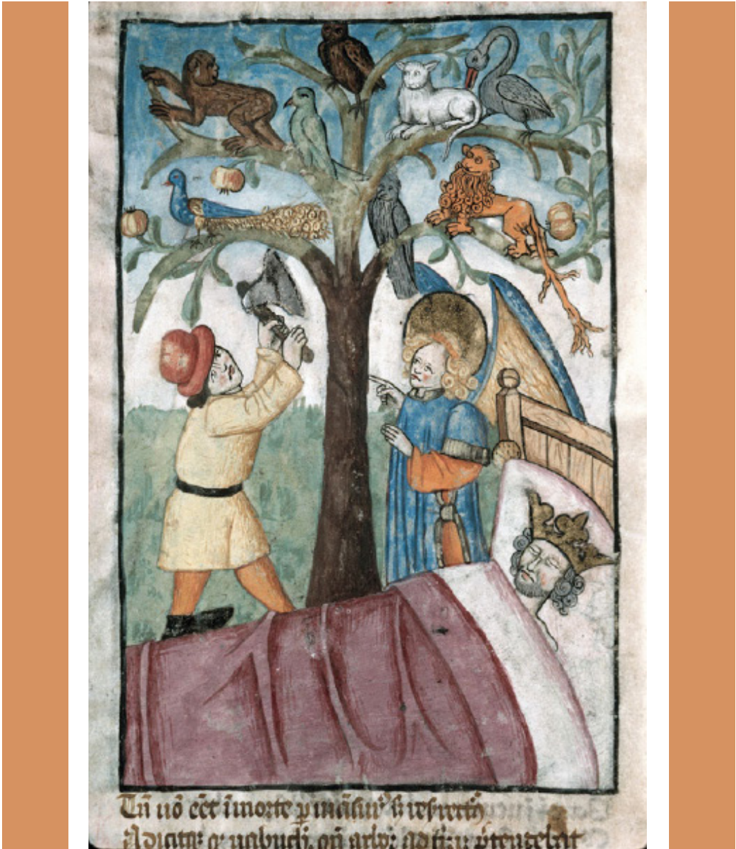
Nebuchadnezzar's Dream in "Ars Moriendi," Marseille, 15th century

SIXTH SUNDAY AFTER EPIPHANY FEBRUARY 16, 2025 • 11:00 AM