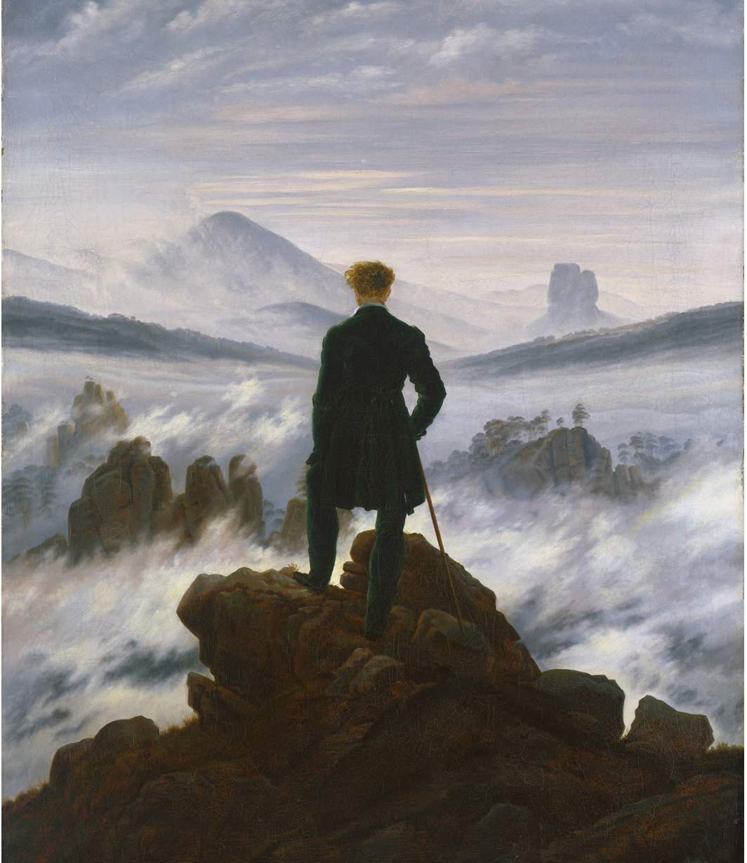
Casper David Friedrich, Wanderer above the Sea of Fog , 1818

THIRD SUNDAY IN LENT MARCH 23, 2025 • 11:00 AM