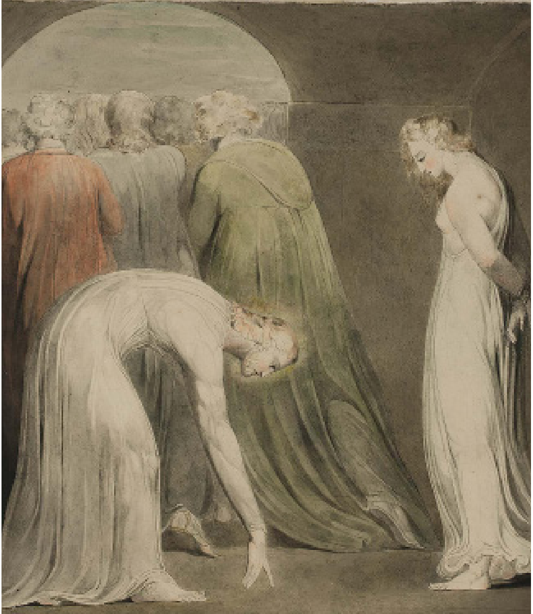
William Blake, The Woman Taken in Adultery , 1805

FIFTH SUNDAY IN LENT APRIL 6, 2025 • 11:00 AM