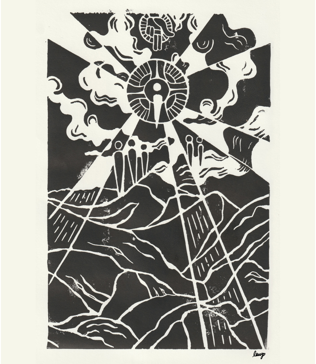
Lauren Wright Pittman, Transfiguration , 2021

ELEVENTH SUNDAY AFTER PENTECOST AUGUST 4, 2024 • 10:00 AM