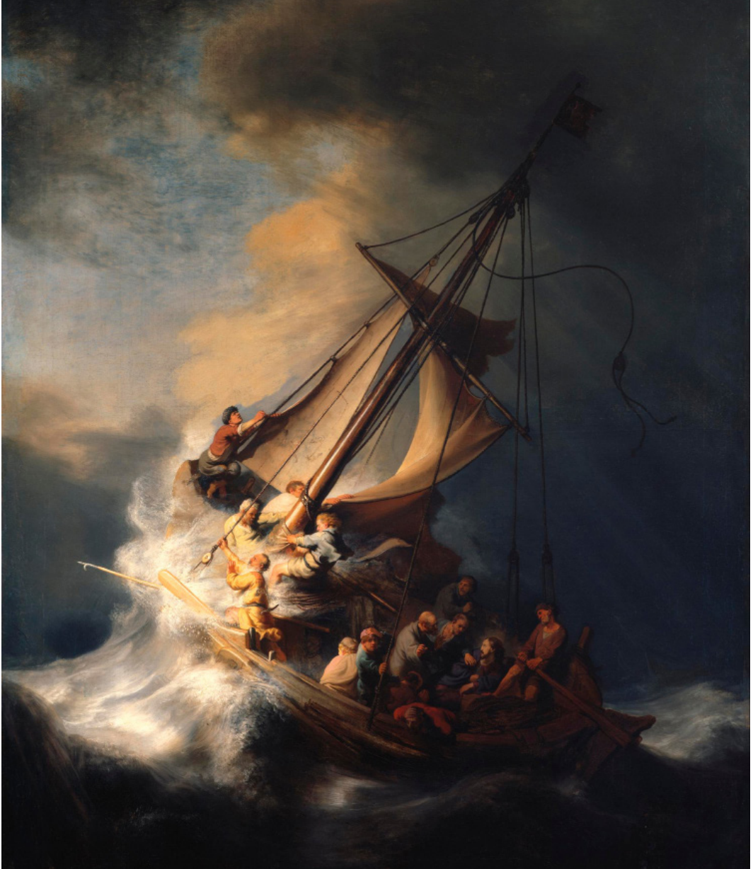
Rembrandt van Rijn, Christ in the Storm on the Sea of Galilee , 1633

EIGHTH SUNDAY AFTER PENTECOST JULY 14, 2024 • 10:00 AM